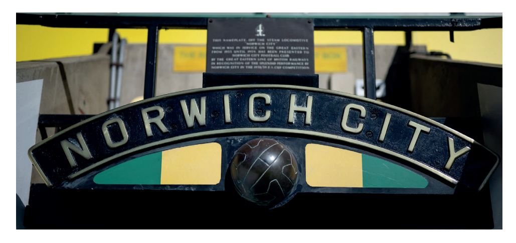
Figure 1. The nameplate of a "Footballer" loco at the stadium of Norwich City FC

with the general public. But in any case it was probably no coincidence that the racehorse names, the "Hunt" class and the "Footballers" were locos of the same company, the only company evincing a chrematonymic interest in sport.