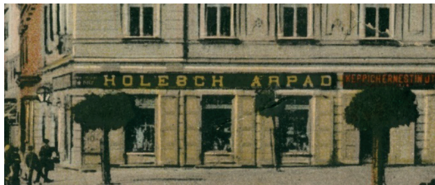
Figure 12. Sign before 1918: Holesch Arpád