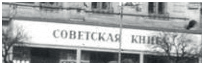
Figure 16. SNP Square of the 1950s: The Soviet Bookstore