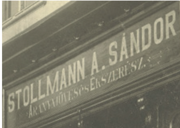
Figure 5. Detail of the sign