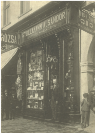
Figure 4. Private signs