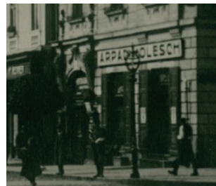
Figure 13. Sign after 1918: Arpád Holesch