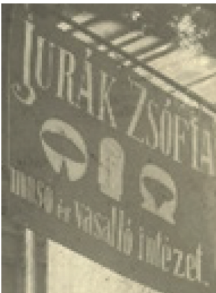
Figure 6. Female name