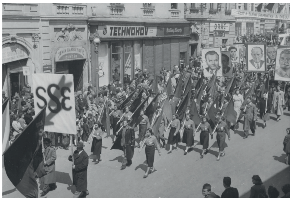
Figure 15. Signs after 1945

The third milestone was the political coup in 1948 – the establishment of the communist dictatorship which meant censorship, a ban on private farming, ideological inscriptions, slogans and banners (see Figure 15 and 16):