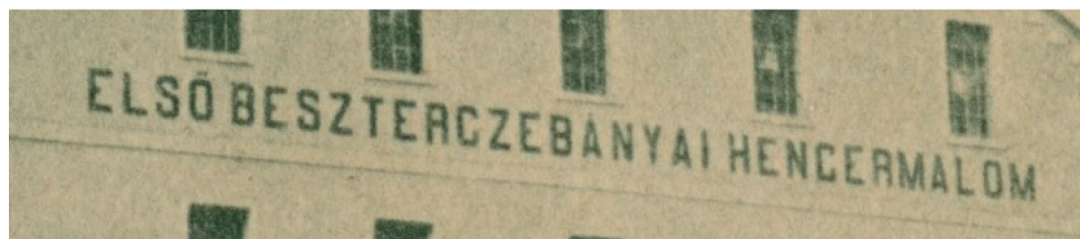
Figure 3. First Banská Bystrica Roller Mill

Until the collapse of the Austro-Hungarian monarchy (1918), the situation of Slovaks in Hungary was very difficult. Hungarian laws suppressed Slovaks' rights to national identity, Slovakian was banned as a language of instruction in schools, and Magyarization of Slovaks gained momentum, especially in the late 19th and early 20th centuries. These pressures also manifested themselves in the LL. Originally Slovak proper names as parts of company names, some urbanonyms, and loyalty to state institutions were reflected in the inscriptions on the buildings – for example, the name of the roller mill, which was situated at the beginning of 'Dolná Street' at the entrance to the town, was in Hungarian (Figure 3). The Hungarian name Első Besztercebányai henger malom can be translated as the 'First Banská Bystrica Roller Mill'.