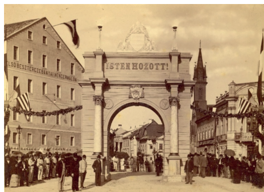
Figure 7. Gate