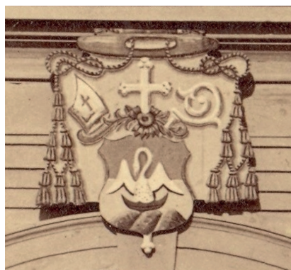
Figure 8. Detail of the gate