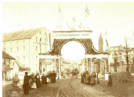
Figure 10. Triumphal Arch